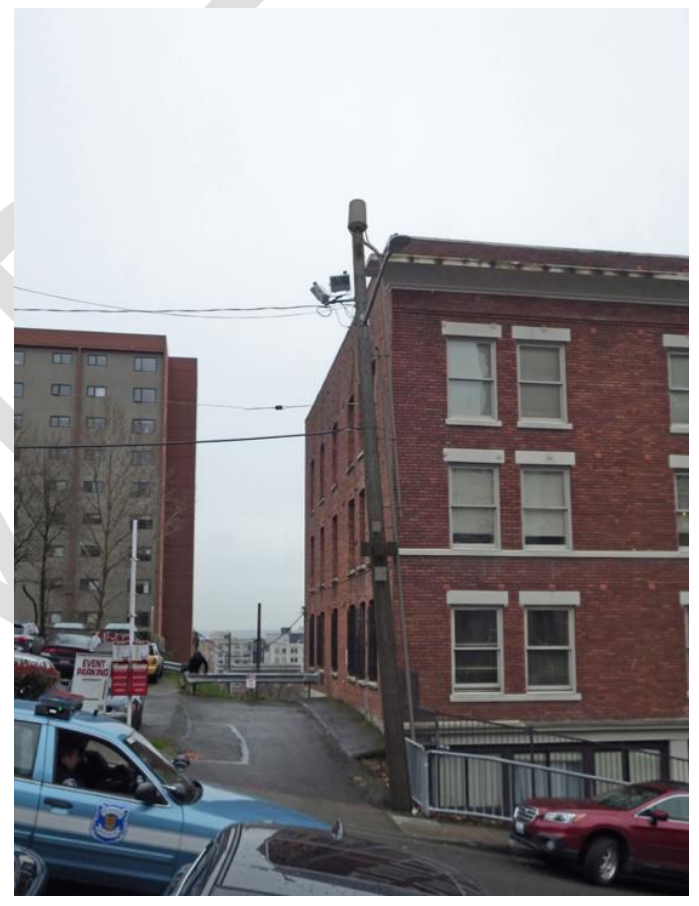
Photo simulation of proposed antenna installation and [new height of pole] utility pole along [insert cross street/area].